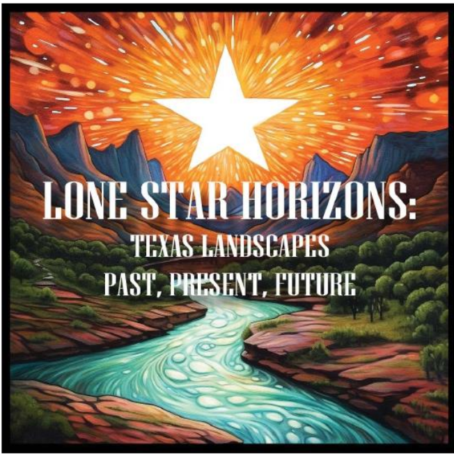
A San Antonio Art League & Museum Member Exhibition

We are thrilled to announce an exciting opportunity for you to showcase your work in our upcoming Members-Only juried exhibition.