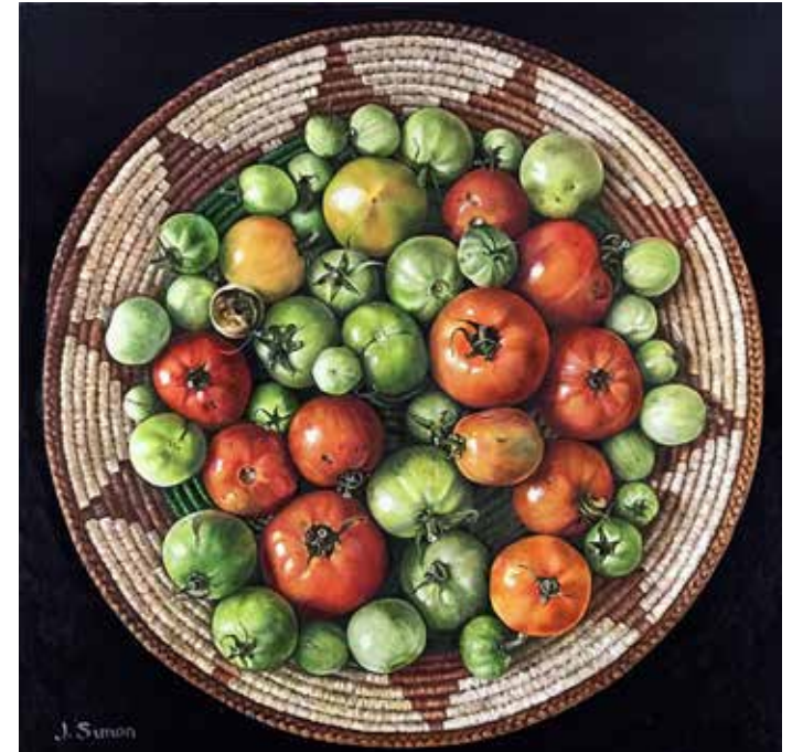
HEB Sponsor Award $750

Danville Chadbourne IMPROVISATIONAL HISTORY FOR LOST POSSIBILITIES 2018 acrylic and ink on wood, acrylic stucco 35.5 x 16 $1800