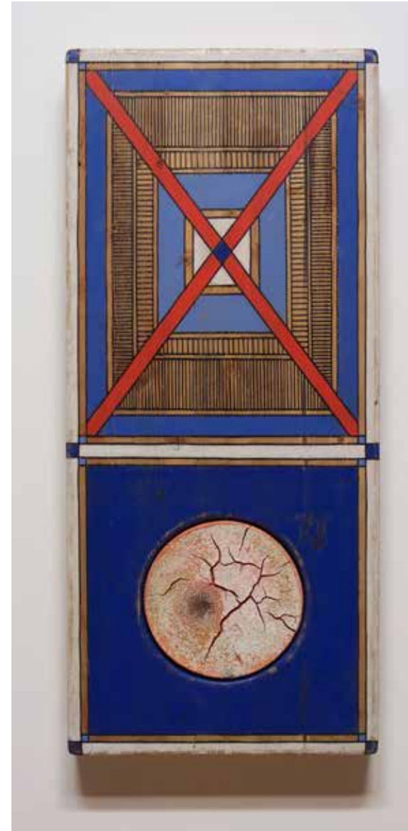
Betty Rihn Keller Memorial Award $800