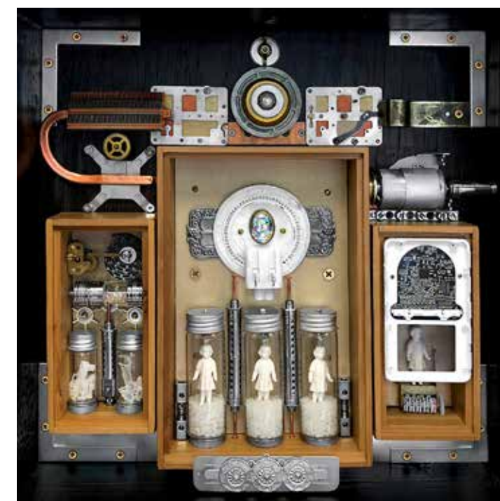
Virginia and Andre Bally 3-D Award $500

Roberta Masciarelli Clonatio Officina (Cloning Factory) 2018 Found objects, electronic waste, repurposed materials 17 x 16 x 5 $900