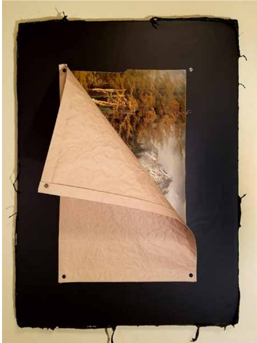
Richard Conn Memorial Mixed Media Award $1000