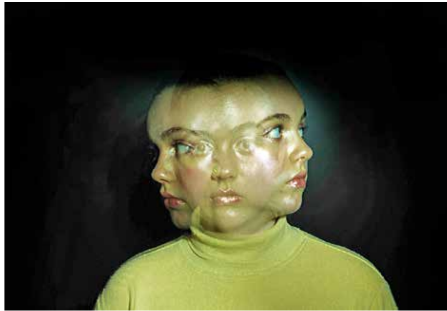
Sonja & Bill Harris Award for Creative Photography $250

Natalie Mund Surrounded 2020 Digital Photography 12x18 $900.00