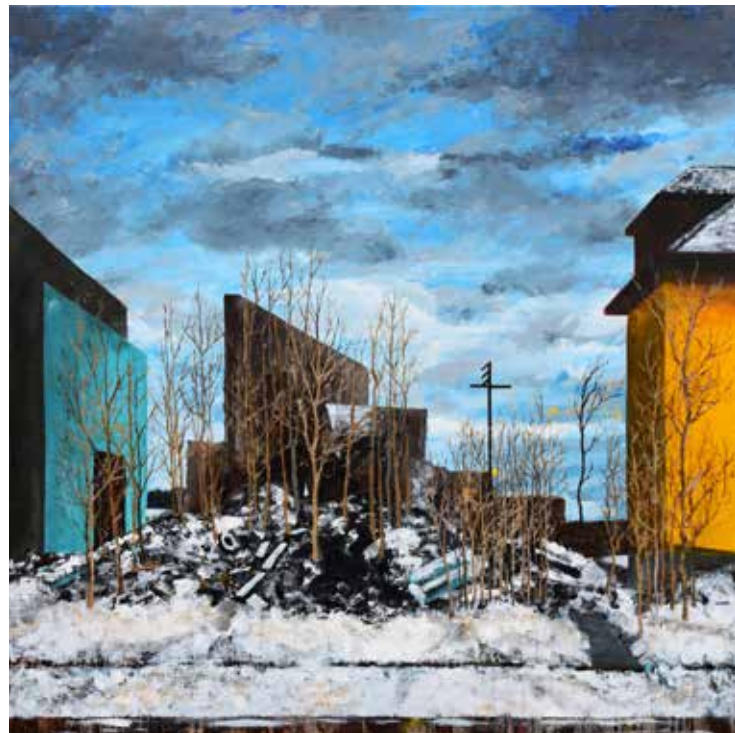
Frank & Cecilia Keller Memorial Award $700