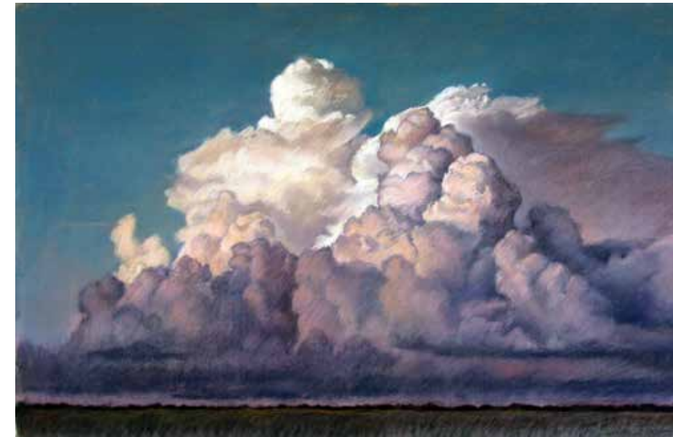
Fred Plank, in Honor of Rena Dubose $250

Nancy Bandy Texas, Coastal Clouds 2019 Pastel on Paper 22 x 33 $1,200