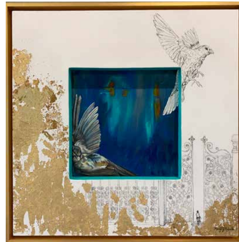
Francis Y. Huang Donor Award for Artistic Excellence $250